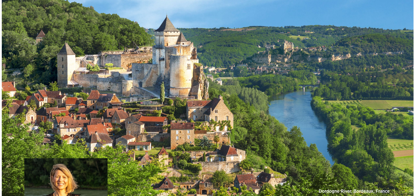
Dordogne River, Bordeaux, France