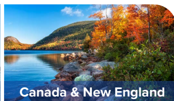
Canada & New England